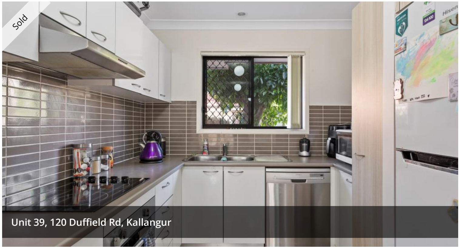
Unit 39, 120 Duffield Rd, Kallangur