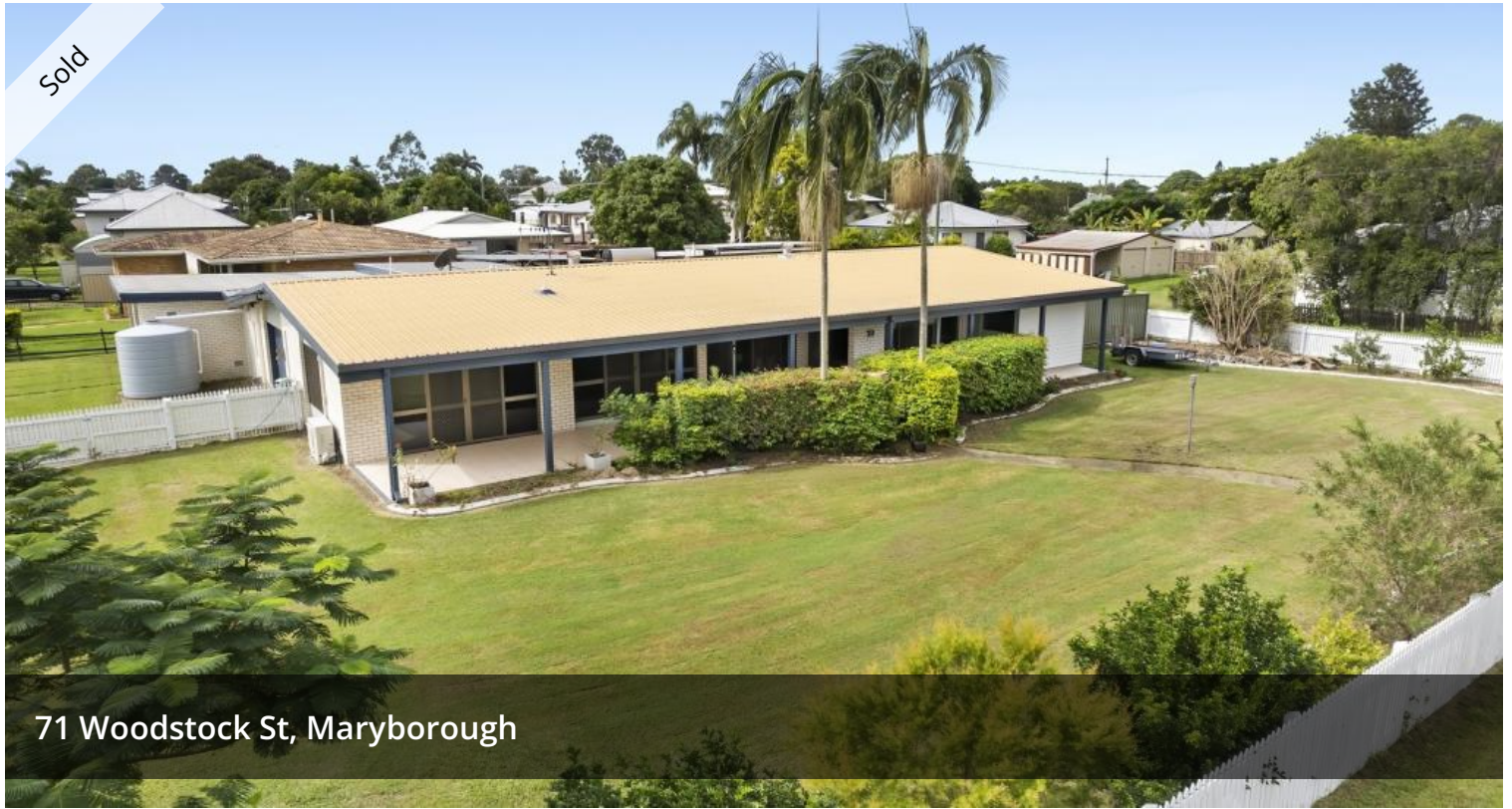
71 Woodstock St, Maryborough