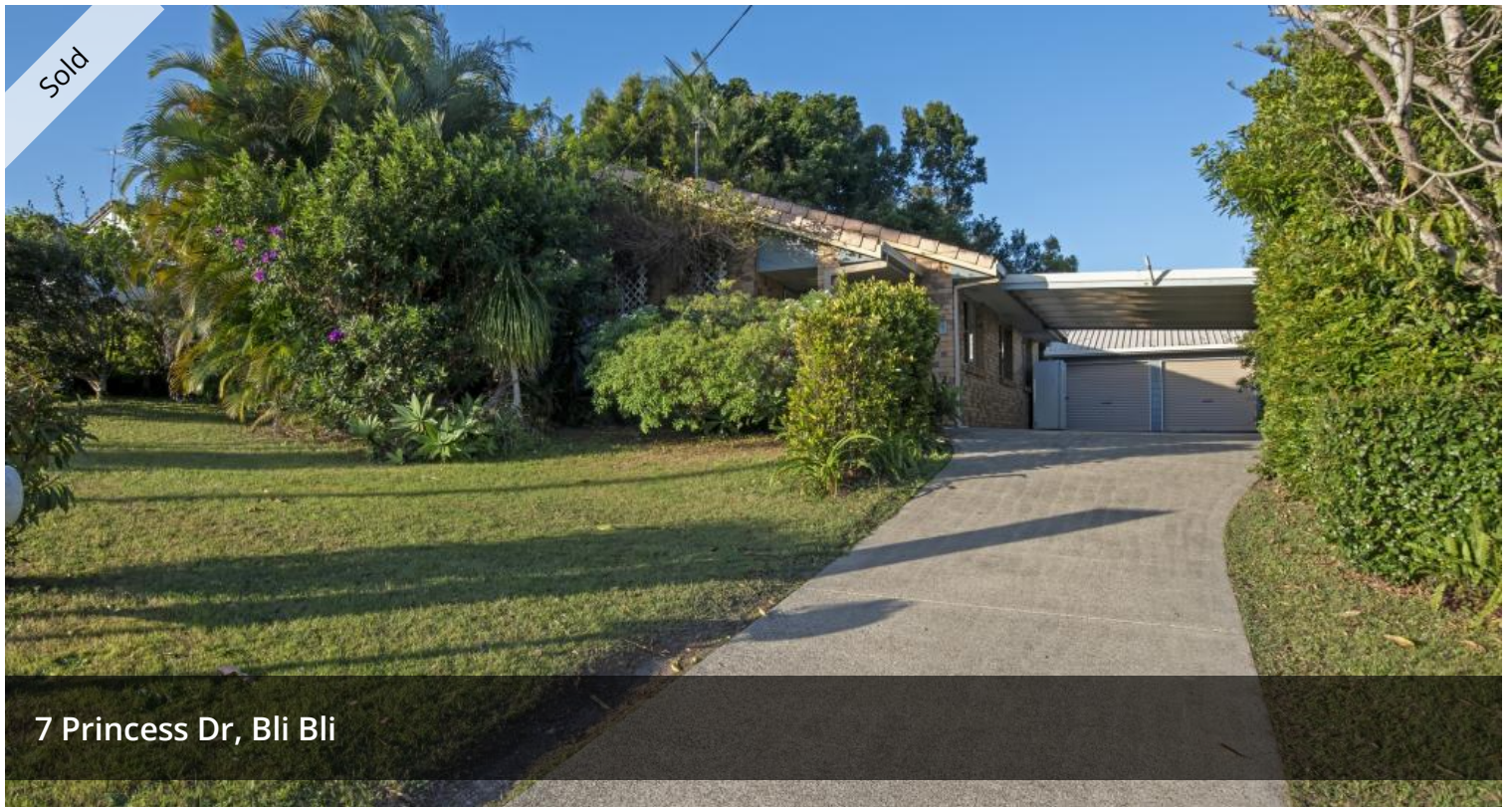
7 Princess Dr, Bli Bli