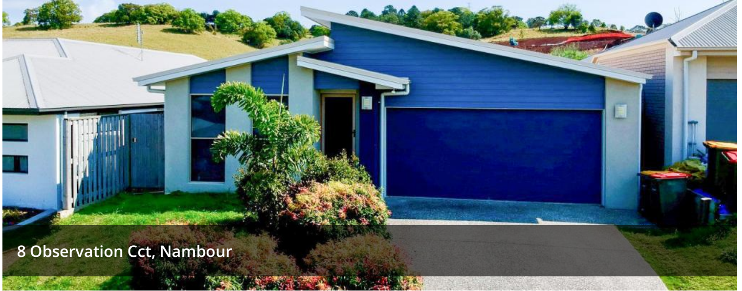
8 Observation Cct, Nambour