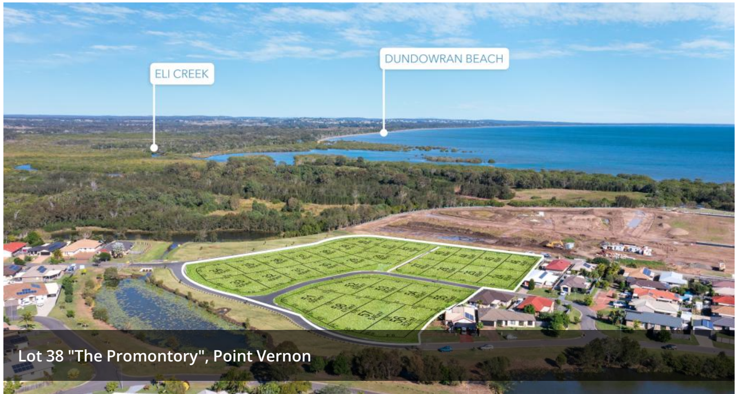
Lot 38 "The Promontory", Point Vernon