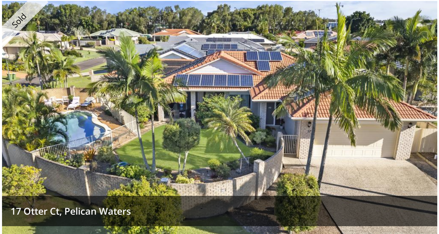
17 Otter Ct, Pelican Waters