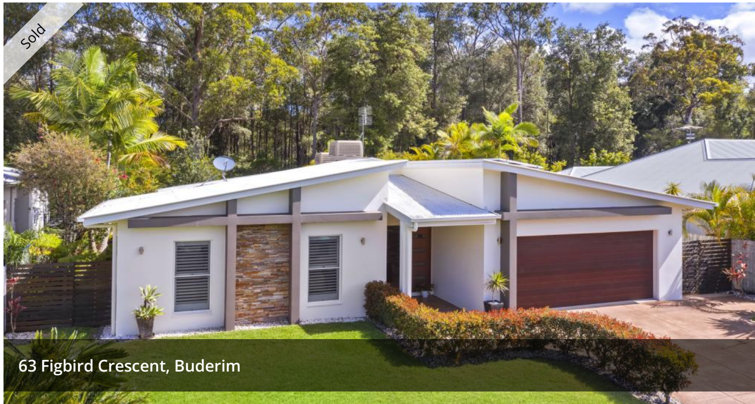
63 Figbird Crescent, Buderim