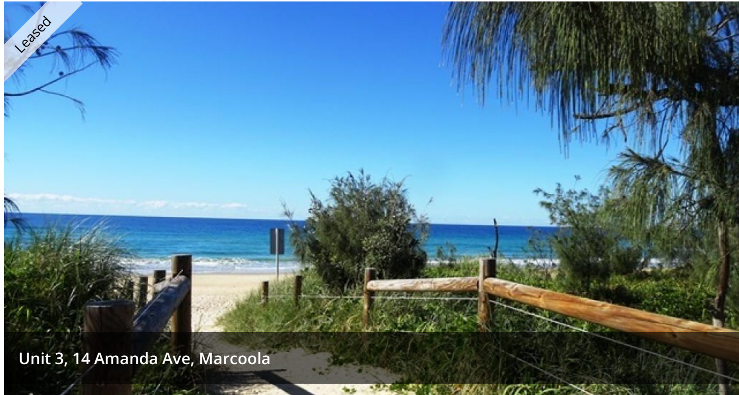
Unit 3, 14 Amanda Ave, Marcoola