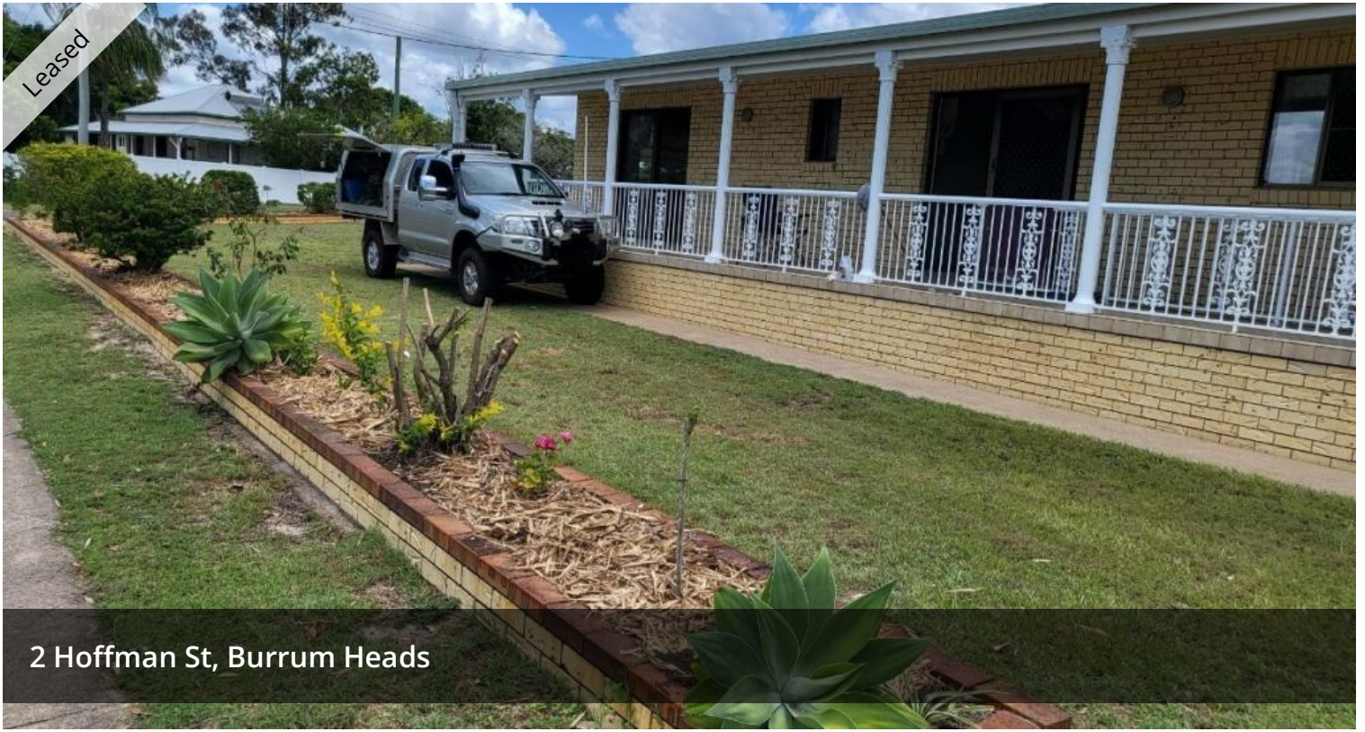
2 Hoffman St, Burrum Heads