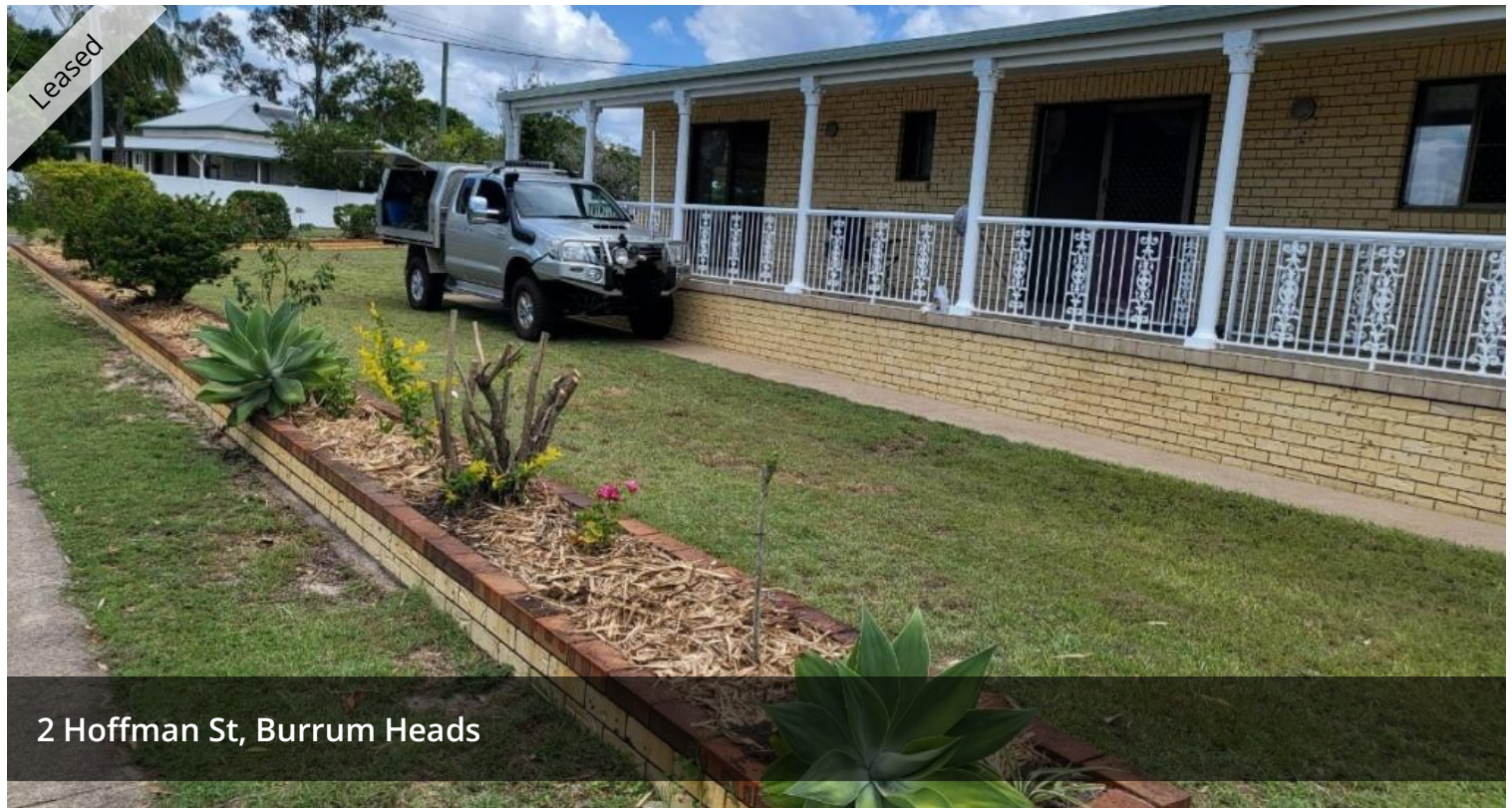
2 Hoffman St, Burrum Heads