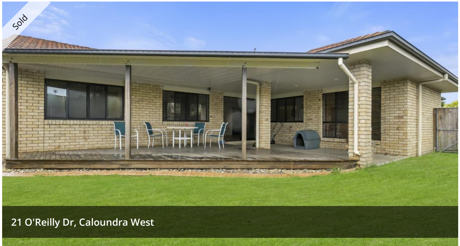
21 O'Reilly Dr, Caloundra West