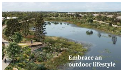
Embrace an outdoor lifestyle