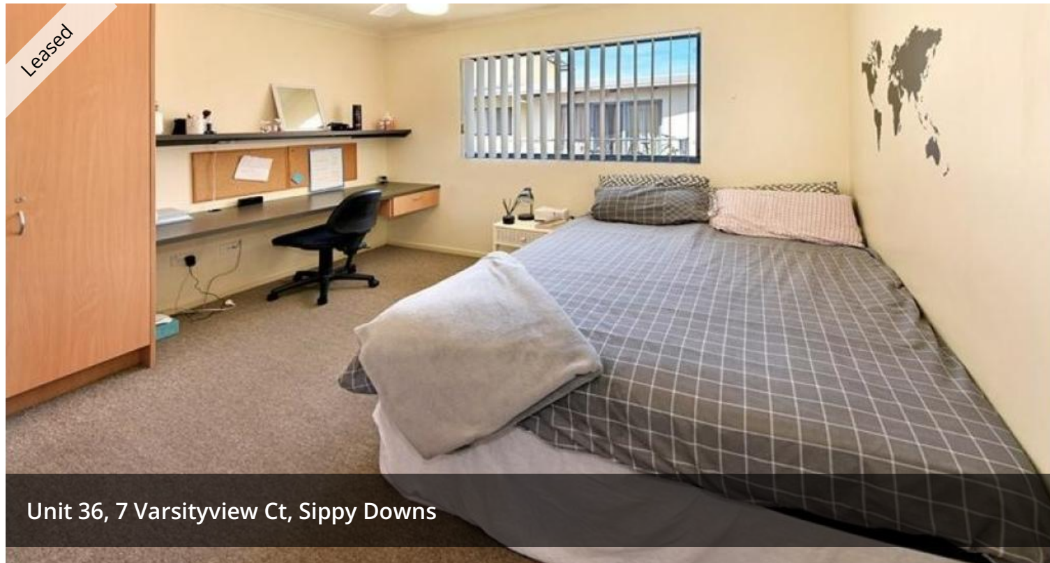
Unit 36, 7 Varsityview Ct, Sippy Downs