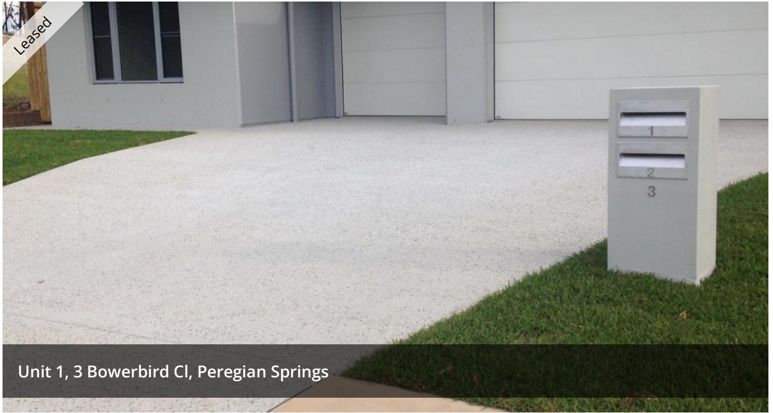
Unit 1, 3 Bowerbird Cl, Peregian Springs