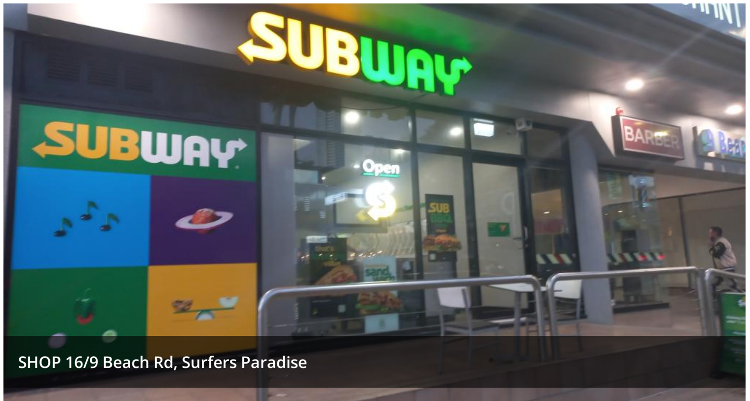
SHOP 16/9 Beach Rd, Surfers Paradise