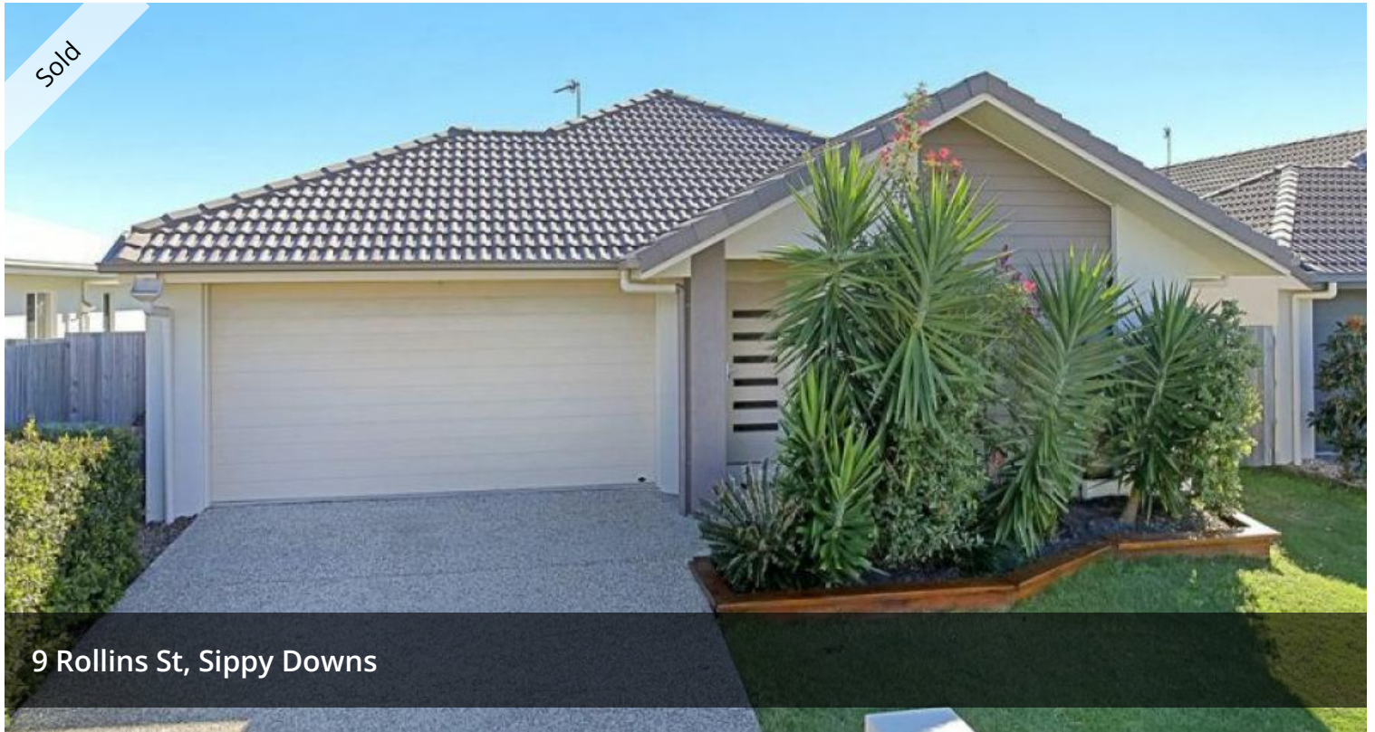
9 Rollins St, Sippy Downs