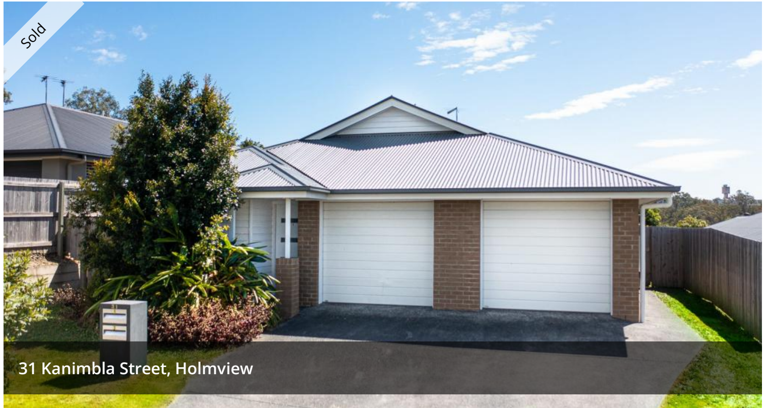
31 Kanimbla Street, Holmview