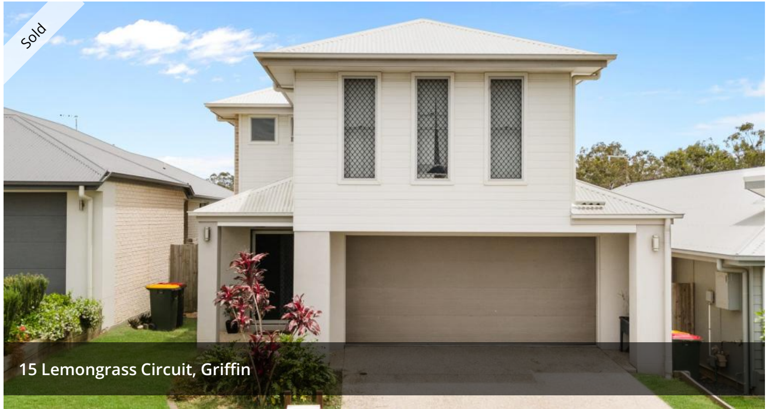
15 Lemongrass Circuit, Griffin