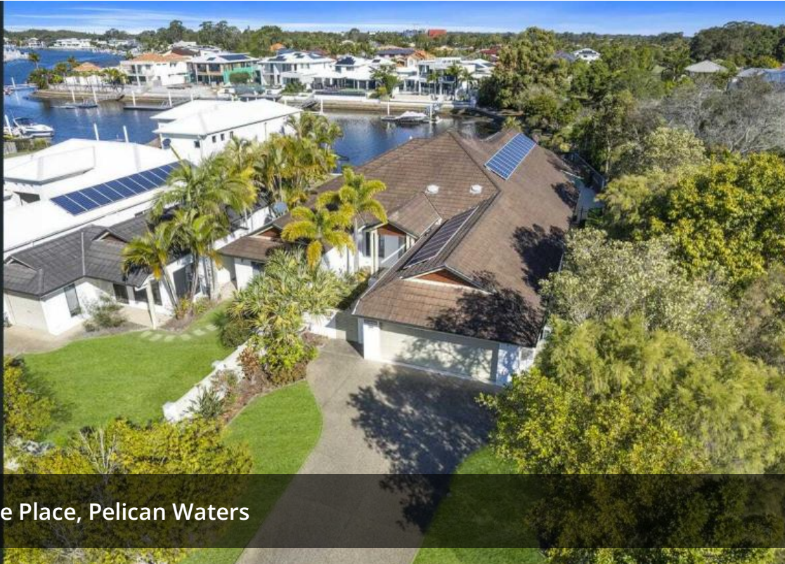
30 Reliance Place, Pelican Waters