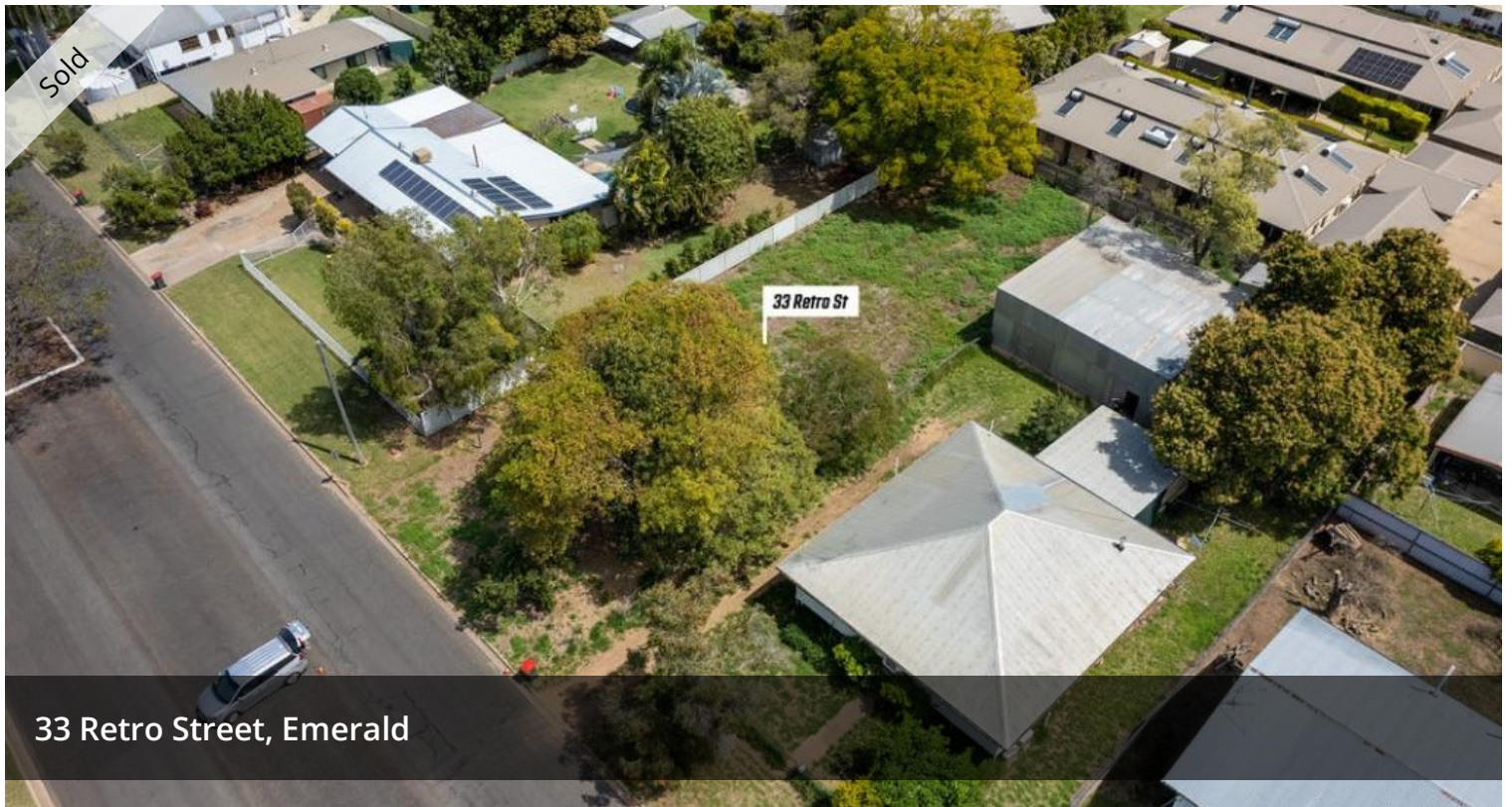
33 Retro Street, Emerald